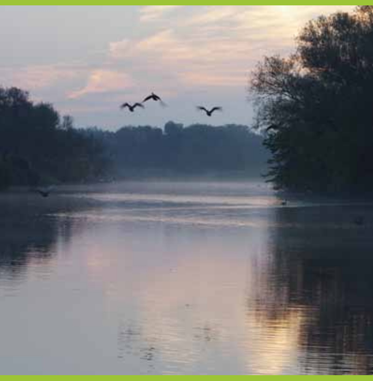
Part of the Niagara Escarpment World Biosphere Reserve Links to the Bruce and Waterfront trails